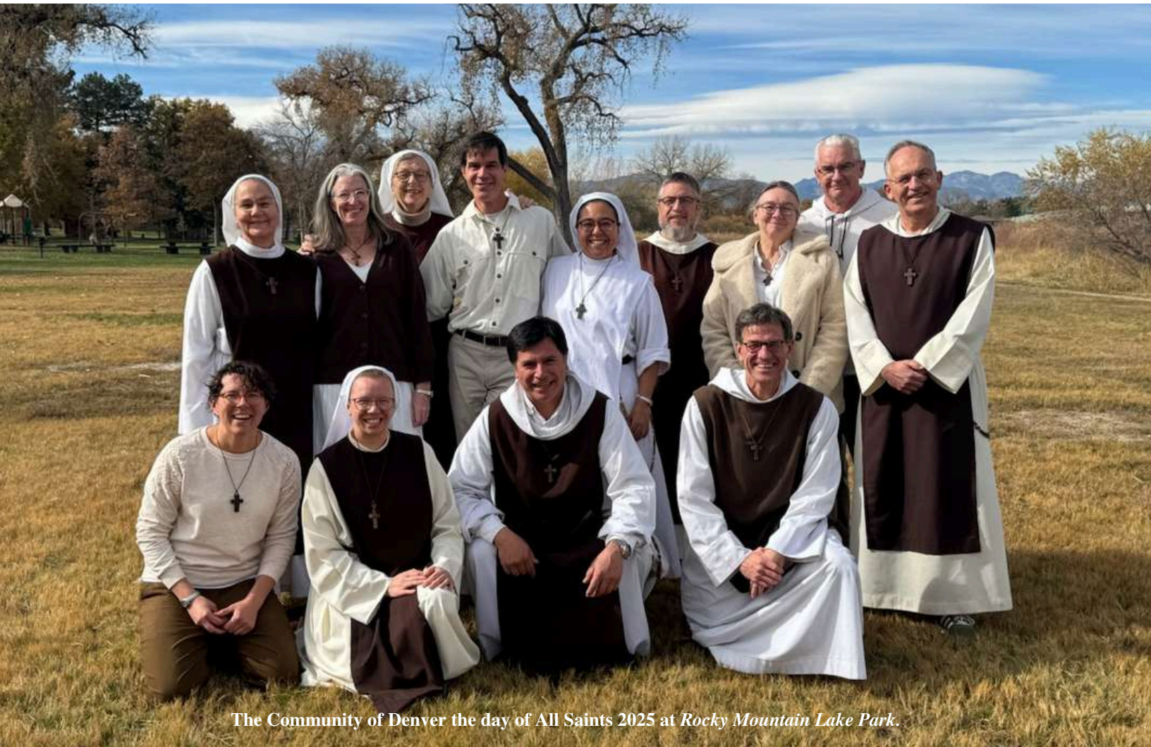
The Community of Denver the day of All Saints 2025 at Rocky Mountain Lake Park.

“The call of the Beatitudes is none other than life in Christ, in whom the Father has chosen us, to be his adopted sons since the beginning of all eternity, ‘for the praise of the glory of his grace.’”