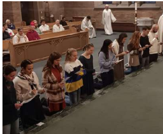
Nov 1 - Disciples of the Lamb make commitments for the upcoming year