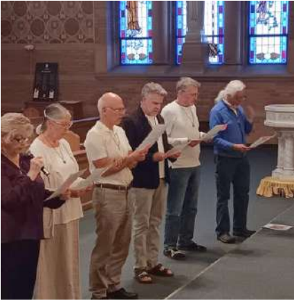
Oct 18 - Friends of the Lamb make commitments for the upcoming year