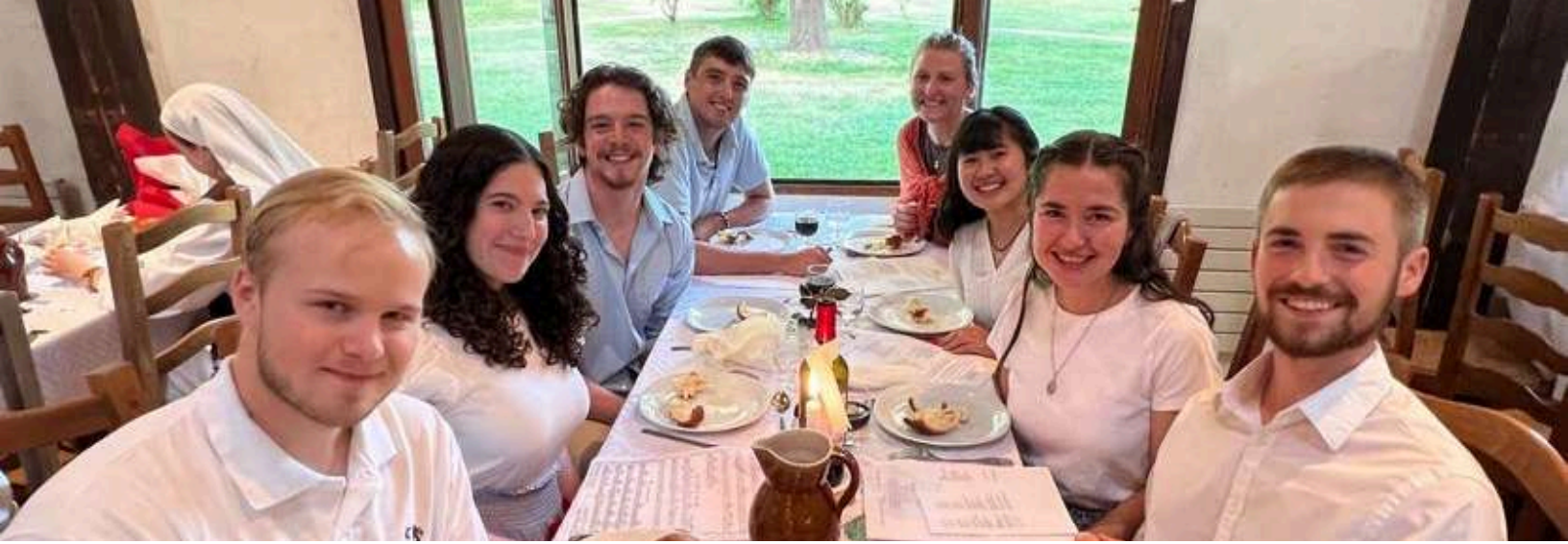
The team of summer interns celebrating Shabbat in Nouan-le-Fuzelier, France.