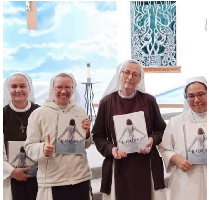
The sisters attending the Undone Retreat organized by the JP11 Healing Center in Denver.