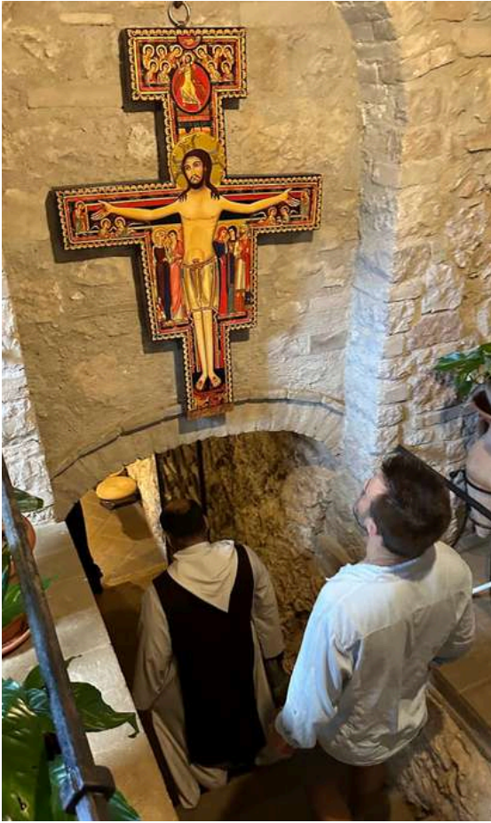
A visit to the “Eremo delle Carceri,” the hermitage of St. Francis and his brothers, about 2.5 miles from Assisi, hidden in the mountains of Monte Subiaso .